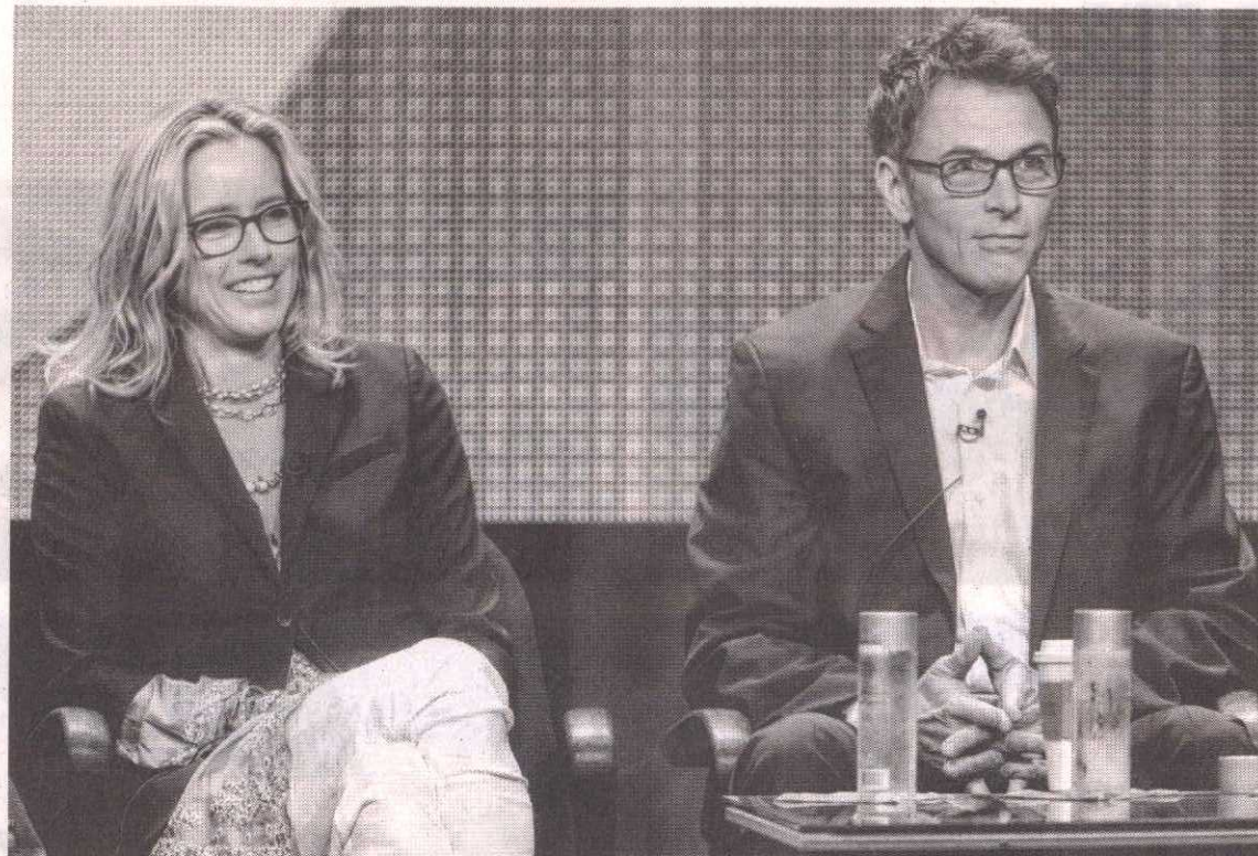
Tía Leoni and Timothy Daly discuss their show Madam Secretary , in which she plays the newly appointed secretary of State. Why not president? "Wait until Year 4," Leoni teases.