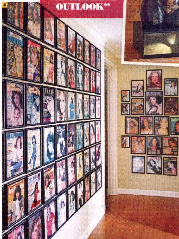
1. ART COLLECTION “I have so many favorite pieces,” says Smith of the works that hang throughout her home. She even has a “dog room” full of paintings of pooches. 2. PRIZED PURCHASE Smith bought this brass bed in her early 20s while living in New York. “I paid it out over a year,” she says. 3. A GIFT FROM AN ANGEL Smith’s Charlie’s Angels costar Farrah Fawcett sculpted this bust and gave it to Smith the Christmas before she passed away in 2009. “We went the distance together,” Smith says of Fawcett. 4. COVER GIRL Smith has kept mementos from her career, including her many magazine covers. “I also have all my scripts upstairs,” she says. 5. COZY KITCHEN NOOK “We eat in there a lot with our three dogs,” says Smith. “Especially at sunset.”