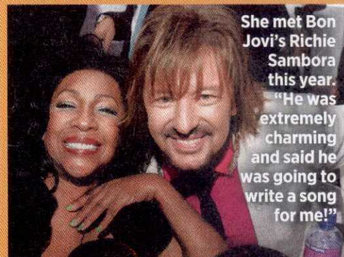
She met Bon Jovi's Richie Sambora this year. "He was extremely charming and said he was going to write a song for me!"