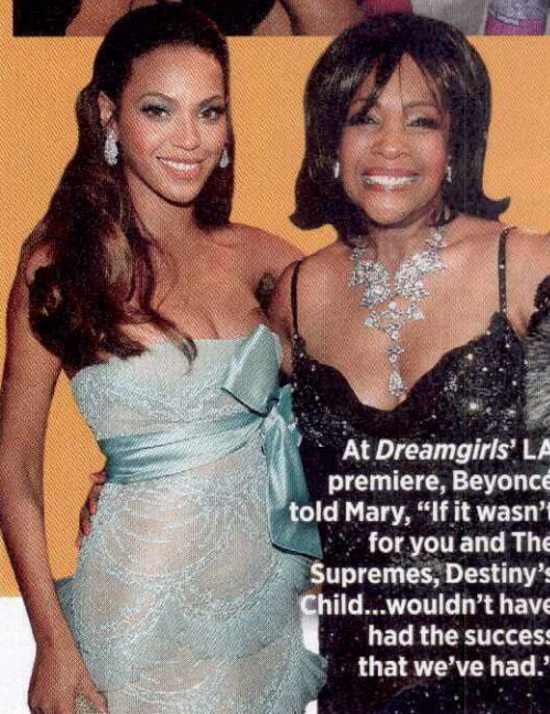
At Dreamgirls' LA premiere, Beyoncé told Mary, "If it wasn't for you and The Supremes, Destiny's Child...wouldn't have had the success that we've had."